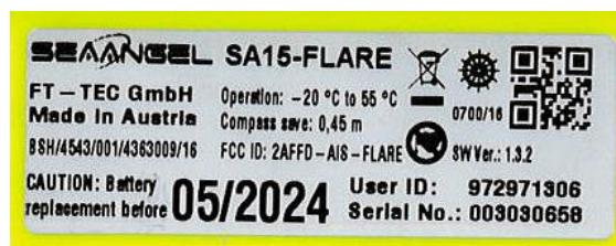
Figure 5: Battery expiration date

You will find the battery expiration date on the back of your SEAANGEL: