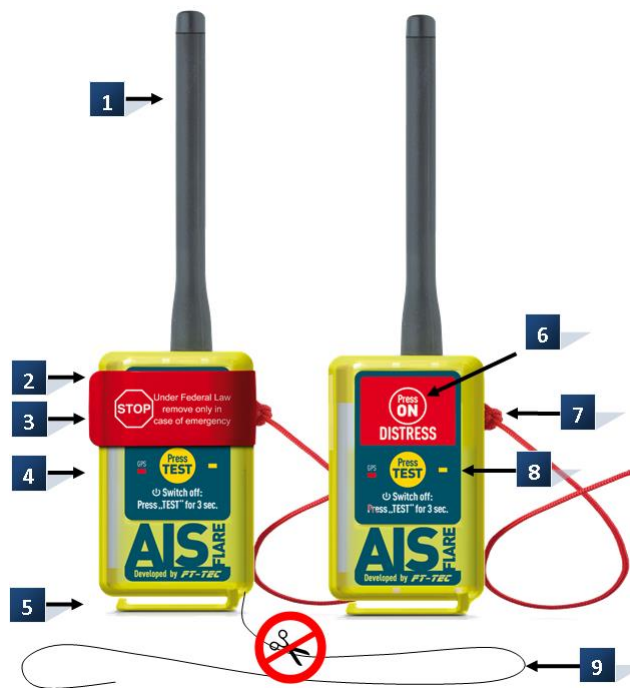
Figure 1: Description of individual components

Your new SEAANGEL is an advanced AIS search and rescue transmitter (SART/MOB). When activated, your SEAANGEL will transmit standardized messages containing its exact GPS position and a request for help to any nearby ship or plane hosting an AIS receiving unit within its transmission range. This makes it easy to find a person in distress, and thus significantly increases the chances of survival.