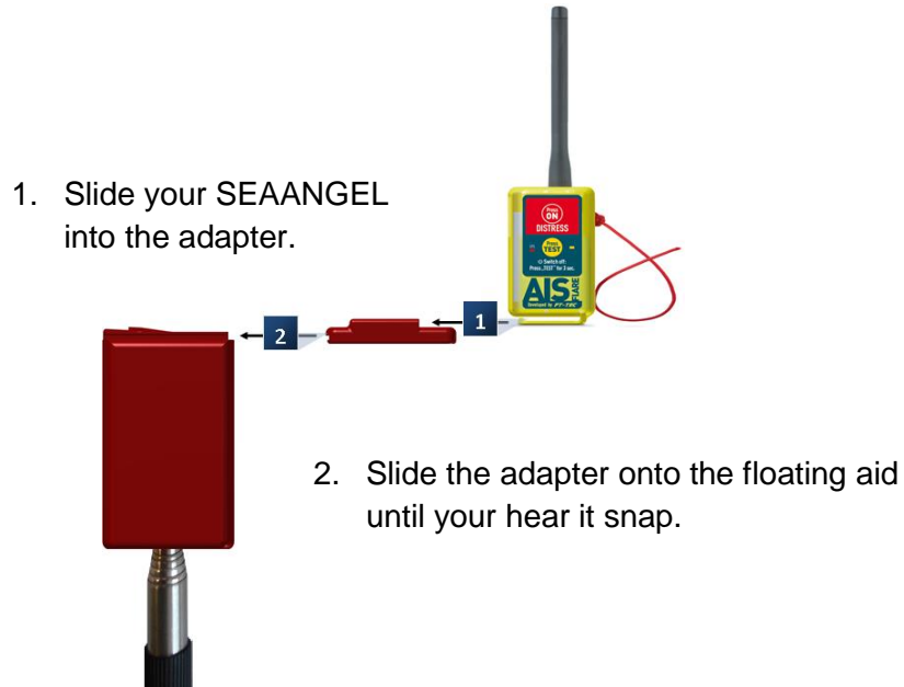
Figure 6: Mounting the SA15 to the prolongation pole

The telescope pole enables you to keep your SEAANGEL at least 1m above sea-level.