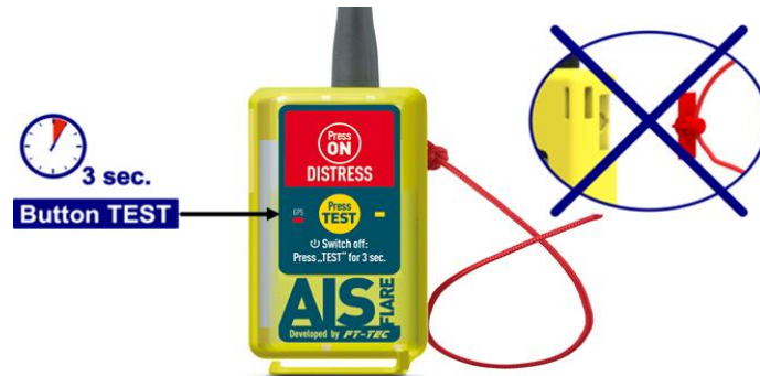
Figure 3: Deactivating the SEAANGEL