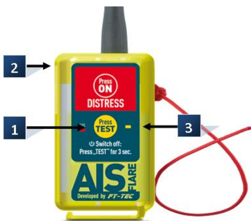
Figure 4: Activating the test operation