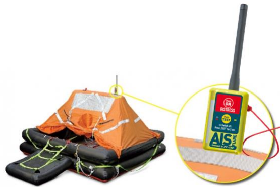
Figure 8: Mounting the SEAANGEL on a life raft

There are so many different life raft models, some of them already offering clipping belts, fastening strips or even pockets for SART beacons. If none of that applies to your life raft you can still mount the SEAANGEL using adhesive tapes to fasten down the clip on the SEAANGEL as shown in the figure below.