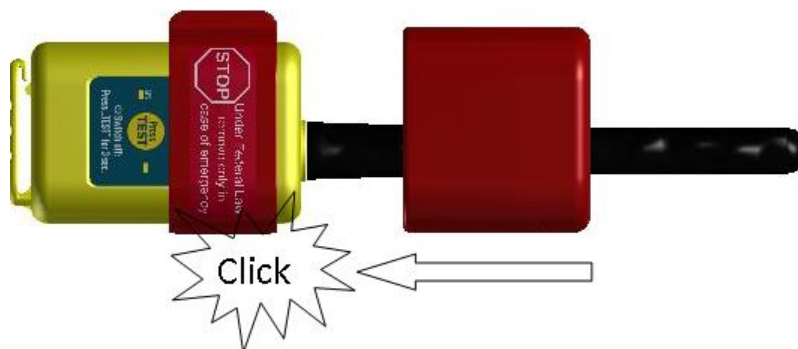
Figure 7: Adding the floating device