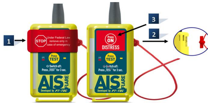
Figure 2: Activating the emergency alarm using the ripcord