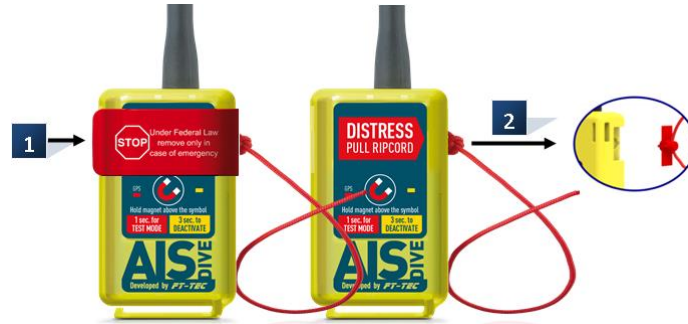
Figure 2: Activating the emergency alarm using the ripcord