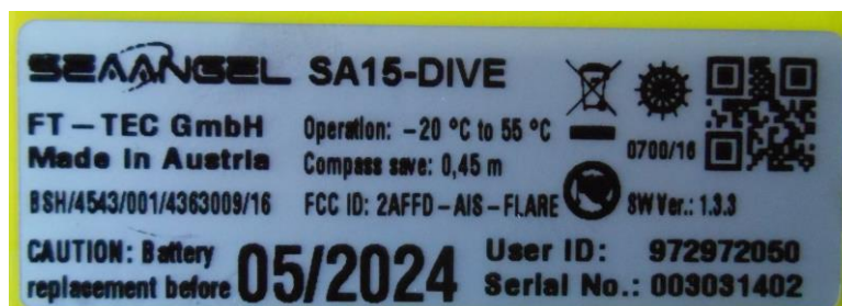
Figure 4: Battery expiration date

You will find the battery expiration date on the back of your SEAANGEL: